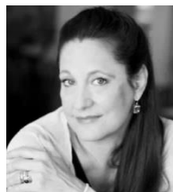
Jayne Anne Phillips