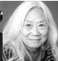
Maxine Hong Kingston