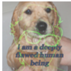
Photo caption 1: One of the works by Louisa Willis to be included in her senior thesis exhibition, “Lumpy Projector”